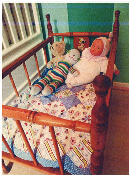
Pancake's beloved knit cat, Tot, is her favourite.