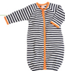
3 giggle Better Basics romper $30