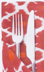
Ikat print napkin, Williams-Sonoma, $29/4; williams-sonoma.com.

You can also tuck in a sprig of rosemary or a mat with your guest's horoscope to inspire table talk!