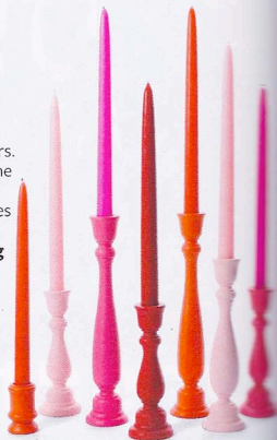
Taper 12" candles, Creative Candles, $12/2; creativecandles.com. Candlesticks, Woodcrafter, from $1; woodcrafter.com. Paints, Mythic, from $12/pint; mythicpaint.com.

tonal family and then paint inexpensive wooden candleholders of all sizes in similar hues using latex paint. The dazzling result: a head-turning forest of vibrant candles that rivals even the fanciest of centerpieces—for a fraction of the cost!