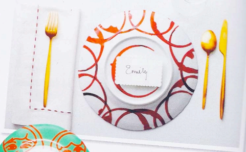
Metro Quadro plates, Richard Ginori, $120 each; 800-624-4034. Pick Stitch napkin, Kim Seybert, $80/4; kimseybert.com. Night 5-piece place setting, Diane von Furstenberg Home, $105; dvf.com. Scallopette place cards, Bell'occhio, $6/12; bellochio.com.

THE UP SIDE OF UPSIDE DOWN Inspired by the clever new plate designs that treat the bottom with as much attention as the top, we created a quirky place setting by turning everything—the wine-glass, plate, fork, and spoon—upside down. Your guests will flip everything back again, once dinner appears and the vino starts flowing.