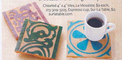
Chiseled 4" x 4" tiles, Le Mosaïste, $9 each; 213-309-3225. Espresso cup, Sur La Table, $2; surlatable.com.

TILE STYLE Use a tile as you would a saucer or a coaster, or line up multiples (related by style or color) down the center of the table to create a runner effect. Find decorative ones at an upscale flooring shop, the flea market, or a bazaar in a far-flung country.